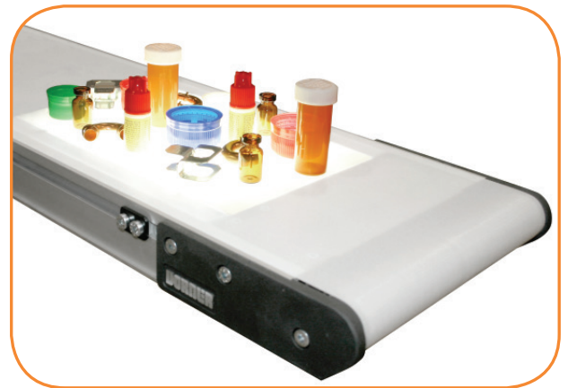
Ideal for a variety of products