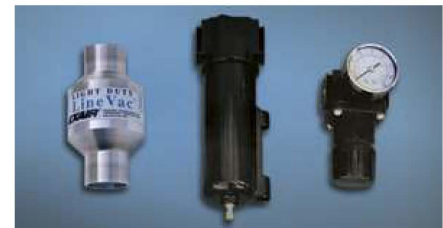
Kits include a Light Duty Line Vac, filter separator and pressure regulator (with coupler).