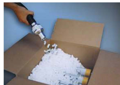
A Model 130125 1-1/4" (32mm) Light Duty Line Vac can fill or empty the packing peanuts from shipping cartons.