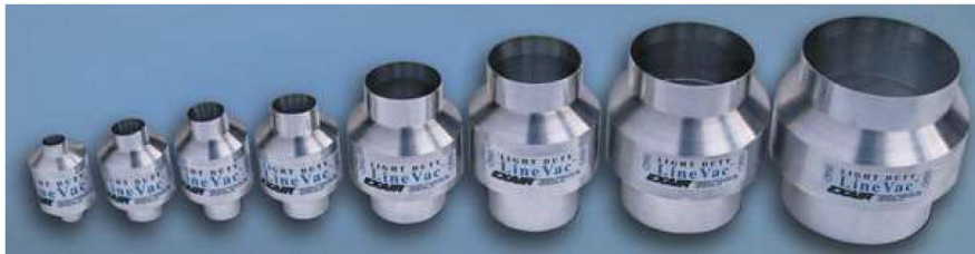
Light Duty Line Vacs are available in eight sizes for diameters from 3/4" to 6" (19 to 152mm).