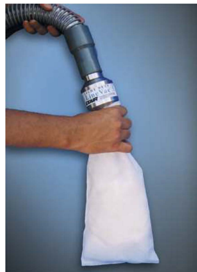
The low cost Model 130200 2" (51mm) Light Duty Line Vac conveys fibers to fill pillows, stuffed animals, diapers, etc.