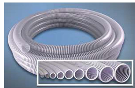
PVC hose is available in lengths up to 50' (15.2m) and diameters up to 3" (76mm).