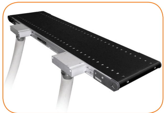
Can be Used with a Variety of Vacuum Sources

Vacuum conveyors are made by perforating the belt and drawing air through grooves in the bed of a standard conveyor.